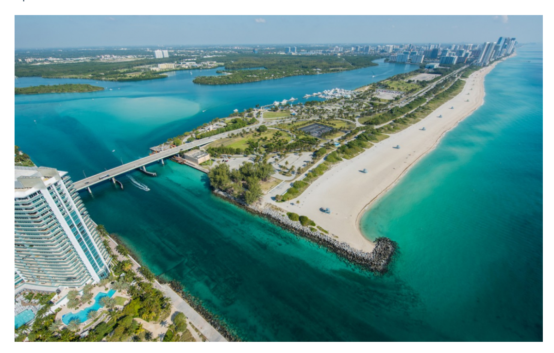
Newport Fishing Pier

This park has a beach, marina, and fishing pier, as well as a dog park and a clothingoptional section of the beach.